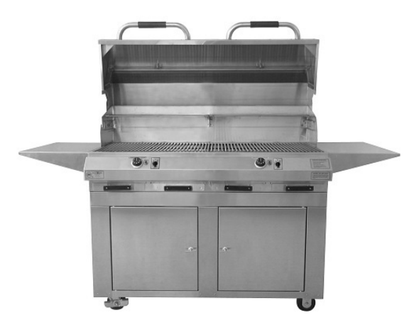
48" MODEL IS 8800-EC-1056-CB-D-48