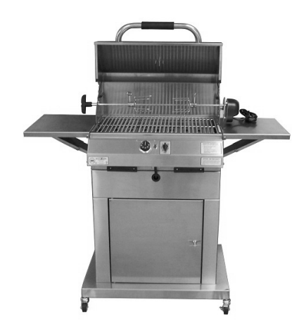
24" MODEL* IS 4400-EC-336-CB-24