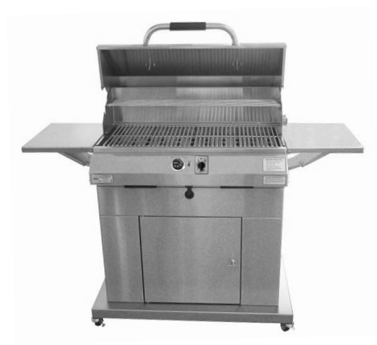
32" MODEL IS 4400-EC-448-CB-S-32 (SINGLE CONTROL)

Required Outlet: NEMA 6-50R Receptacle 208/220 Volt 50 Amp receptacle 50/60 Hz (use with 40 Amp breaker)