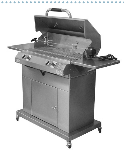
32" MODEL* IS 4400-EC-448-GB-D-32 (DUAL CONTROL)

Required Outlet: NEMA 6-30R Receptacle 208/220 Volt 30 Amp receptacle 50/60 Hz